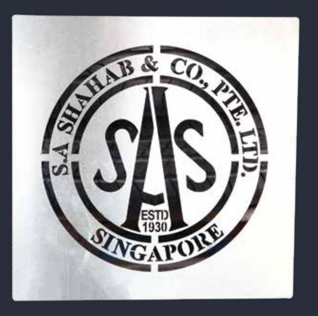
Laser Cut Component